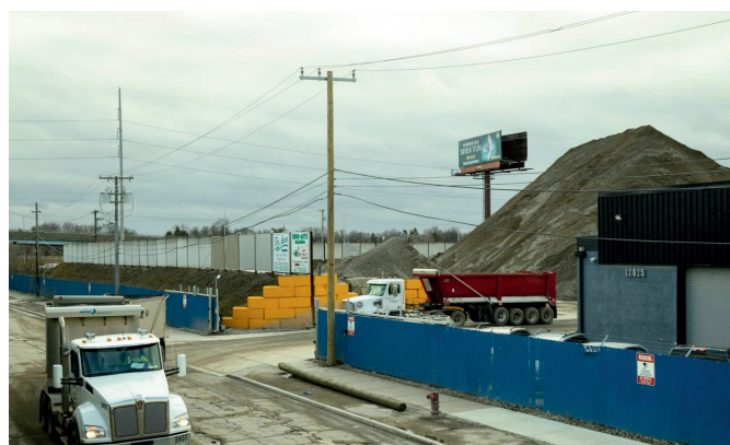
Piles of crushed concrete at Dino-Mite Crushing Recycling in Detroit.

Residents nearby these places often experience dust coating their homes and cars, as well as new or worsening health issues. 2 These facilities likely contribute to health inequities, as they are often located in densely populated neighborhoods where the majority of residents are people of color.