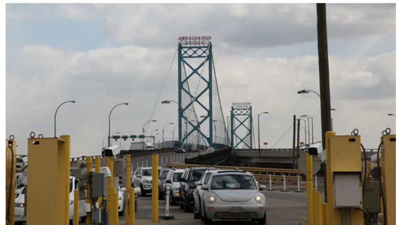
Primary entry lanes to the U.S. at the Ambassador Bridge in Detroit, Michigan.