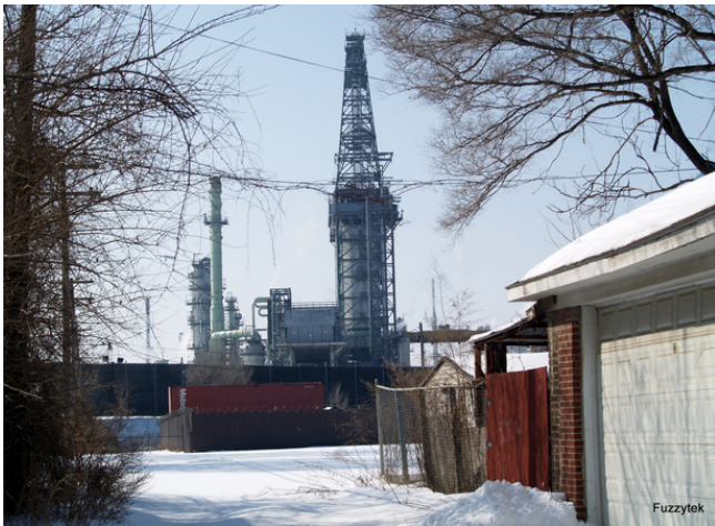
Marathon's Detroit Refinery in Oakwood Heights.